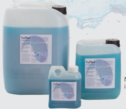
NoPhos is available in 1, 5 and 20 liters

Without phosphate algae and bacteria can't grow