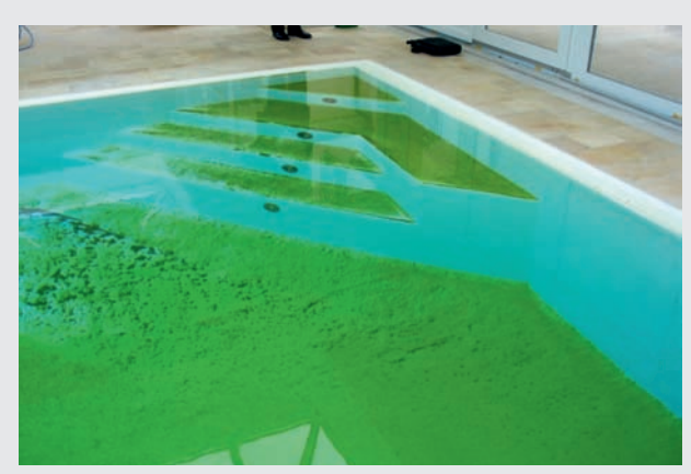
Swimming pool with a strong algae growth

NoPhos is a natural product that can be safely used in public and private swimming pools, as well as in natural pools, ponds and aquaria. NoPhos is a charged ion which reacts with phosphate to form an insoluble precipitate that is removed by AFM®, or it forms an inert deposit on the bottom of the pool that is easily removed.