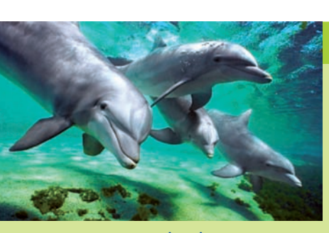
Who is Dryden Aqua?

We are marine biologists specialising in swimming pool water treatment. Our mission is to eliminate toxic chlorine by-products and provide the best air and water quality on the market. For over 30 years we have been working with chlorinated systems for dolphins and other aquatic mammals before successfully introducing our technology to the pool industry. Today, as a testament to the performance, safety and benefits of our integrated water treatment system, there are over 100'000 swimming pools worldwide using our products.